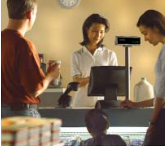
Interfaces with Gilbarco® Point of Sale Systems