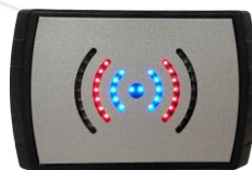
Fueling is Unauthorized