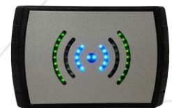
Fueling is Authorized