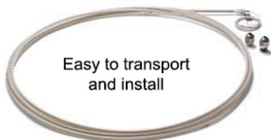
Easy to transport and install