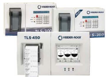
Scalable TLS portfolio: TLS-300, TLS-350, TLS-450

To configure the right Veeder-Root AST monitoring system for your sites, contact a Veeder-Root Distributor or visit www.veeder.com .