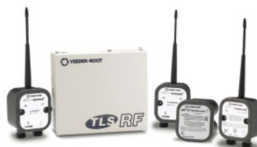
TLS-RF Wireless 2 System: TLS-RF Unit, Receiver, Repeater, Mag-XL Battery Powered Transmitter

The TLS-RF Wireless 2 Kit reduces installation time and eliminates costly wiring from the tank to the TLS Console.