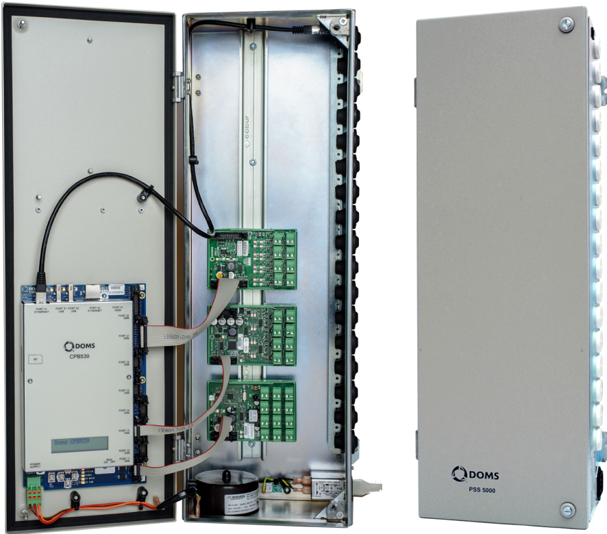
PSS 5000 unit opened (to the left) and closed (to the right). The CPU board and hardware interface modules are mounted inside the controller box, where the POS and forecourt equipment are connected.